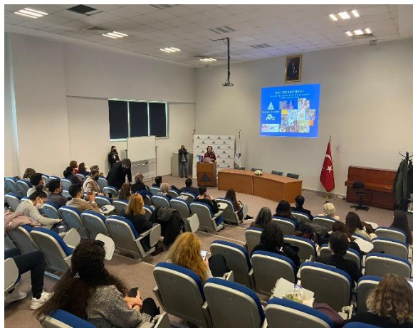
Scene from the In-person session at Yeditepe University (Istanbul, Turkey) – Day 3 of the EURIE22