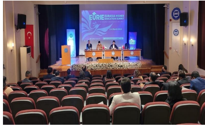
Scene from an in-person sessions at Marmara University – Day 2 of EURIE2022

For Virtual Sessions, the Faculty Members from FUCP and FUSST visited FUI Secretariat office and attended the virtual sessions, held simultaneously in two (2) different halls.