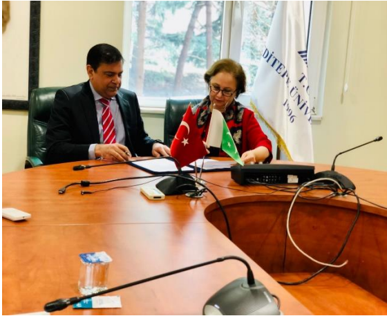
The Rector FUI and Rector Yeditepe University, Turkey signing the MoU agreement at the occasion of EURIE22