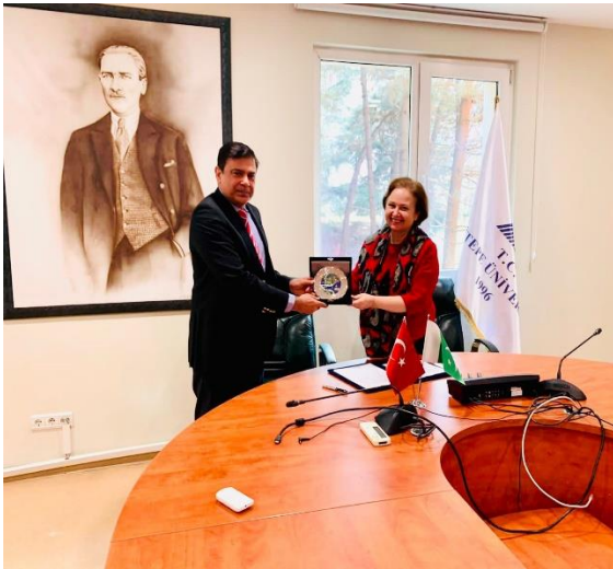
The Rector – Yeditepe University presenting commemorative shield to the Rector FUI after signing the MoU Agreement