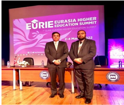
The Rector FUI and Registrar FUI in Marmara University

The second day of the EURIE22 was scheduled in Marmara University for In-person sessions. The Rector FUI and Registrar FUI visited Marmara University, they attended in-person sessions, were briefed about the university in a campus tour, and had a productive meeting with officials of Marmara University which led to the start of academic cooperation between FUI and Marmara University.