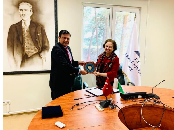
The Rector FUI presenting commemorative shield to the Rector Yeditepe University after signing the MoU Agreement