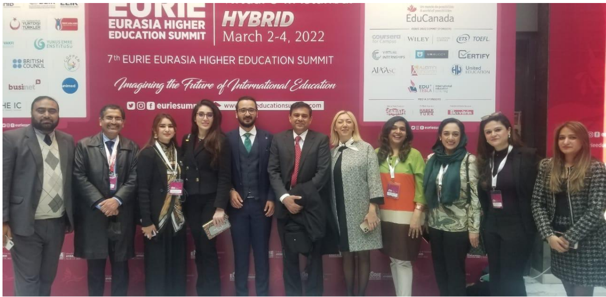
The Rector FUI and Registrar FUI standing with organizers of the EURIE2022 at Istanbul Aydin University (Istanbul, Turkey) along with officials from NUST, IBA-Karachi, COMSATS, & Superior University, March 02, 2022