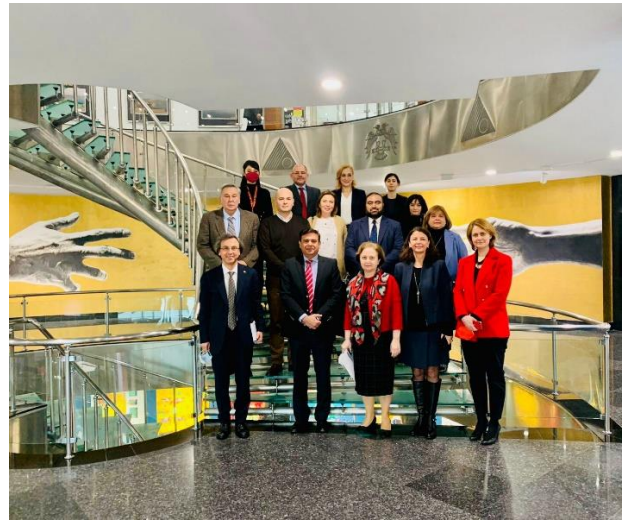
The Rector FUI and Registrar FUI posing for a group photo with the Rector Yeditepe University and its officials.

In virtual Sessions of Day 3, FUI faculty members showed interest in sessions related to online learning with details on ed-tech and pedagogies for online learning.